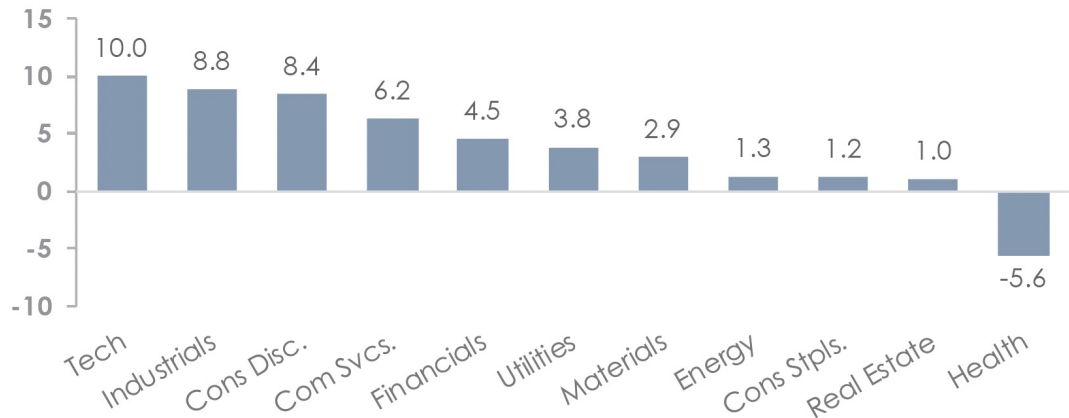
FIGURE 2 U.S. Sector Returns (May in %)

Data Reflects Most Recently Available As of 5/31/2025